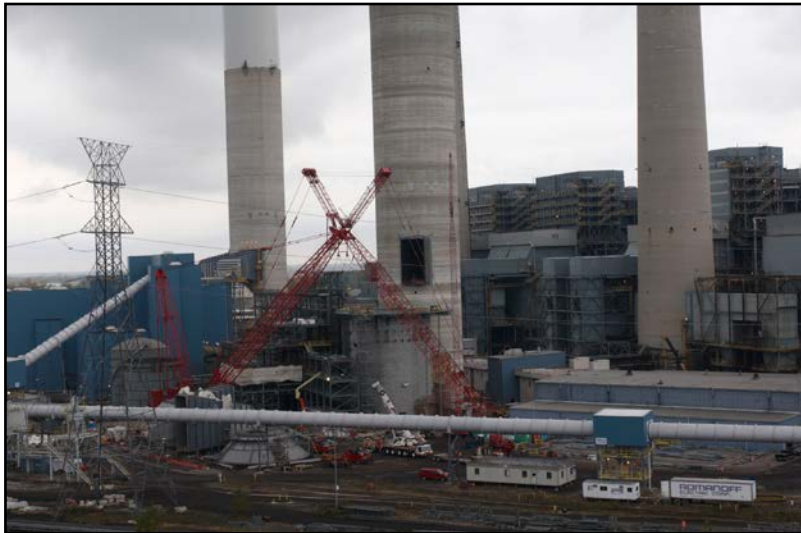
BWCC provided construction services for all B&W-supplied wet FGD system equipment at the Monroe power plant.