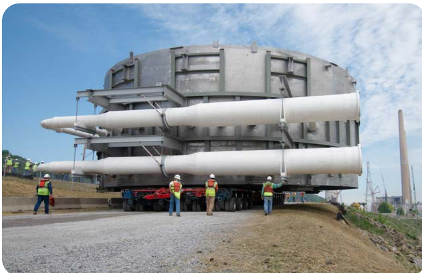
Wet FGD module on transporter moving to plant for installation.