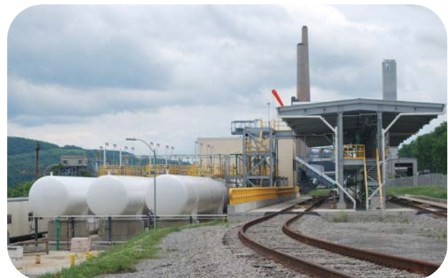
Ammonia storage tanks and rail station, along with the necessary pumps, valves and piping were all part of BWCC's balance of plant responsibilities.