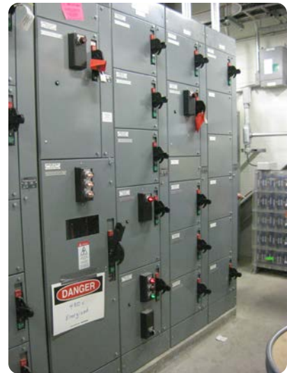
SCR motor control centers.