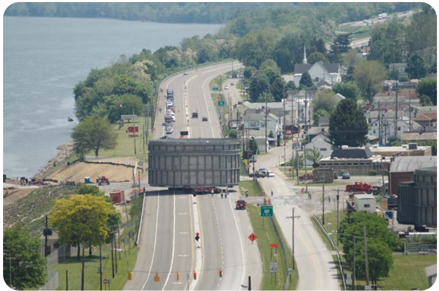
Wet FGD module crossing highway from barge unloading.