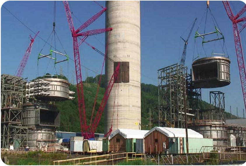
Dual wet FGD lift, June 2008.