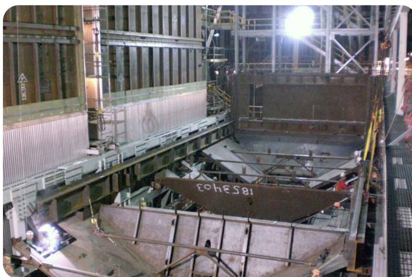
Unit 6 SCR reactor under construction.

also runs along the exterior of the plant. Due to the congested site, all three wet FGD absorbers were located south of the plant, in what was a parking lot. The absorbers were shop fabricated in Mississippi as large alloy modules weighing up to 290 tons each and transported by barge to the job site. Another significant project challenge was removing the existing electrostatic precipitator (ESP) and installing the new SCR equipment in the space previously occupied by the abandoned ESP.